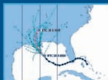
48-hour forecast (red) and observed track (black) of Hurricane Katrina at 5-hour intervals (diamonds); forecast is the mean of statistically-chosen track assemblage (green lines)

Tropical cyclones are extremely destructive. Prediction of wind velocities and paths is essential to save human life and protect the world's economy. Europe is situated "down wind" thus not directly threatened by tropical cyclones but "fall out" on the economy is world wide from delayed transportation, cut-off from supplies, increase in insurance rates and decline in tourism.