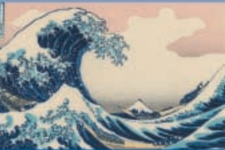
The giant wave

European coastal areas have been affected by large tsunamis throughout history: Following Santorini volcanic eruption, tsunami destroyed the Minoan culture; following the Storrega Slide off Norway, much of Northern Europe was devastated; following the 1755 Lisbon earthquake, with a still poorly understood source, a tsunami killed thousands of people.