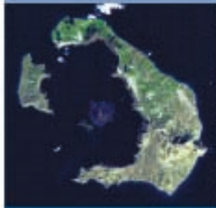
Santorini ca. 400 b.p.